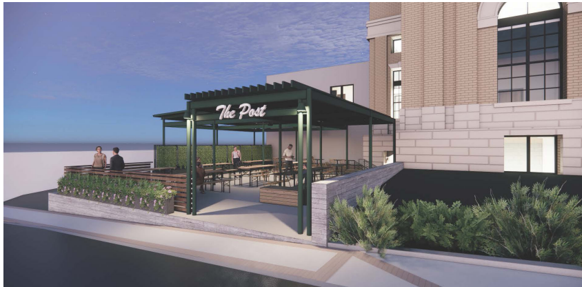
PATIO VIEW FROM CORNER OF FEDERAL STREET AND MAIN STREET