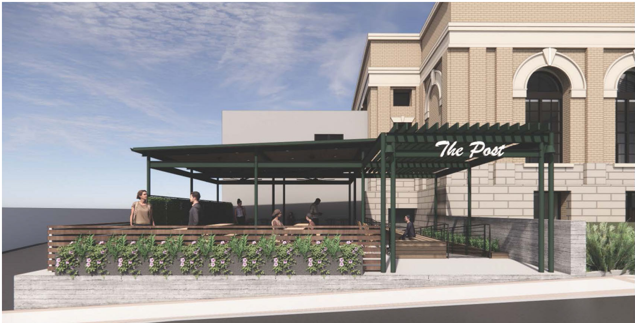
ENTRY TO SUBJECT SPACE FROM COVERED PATIO

THE POST 401 N. Main Street Anderson, SC 29621