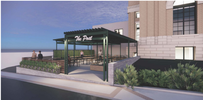
PATIO VIEW FROM CORNER OF FEDERAL STREET AND MAIN STREET