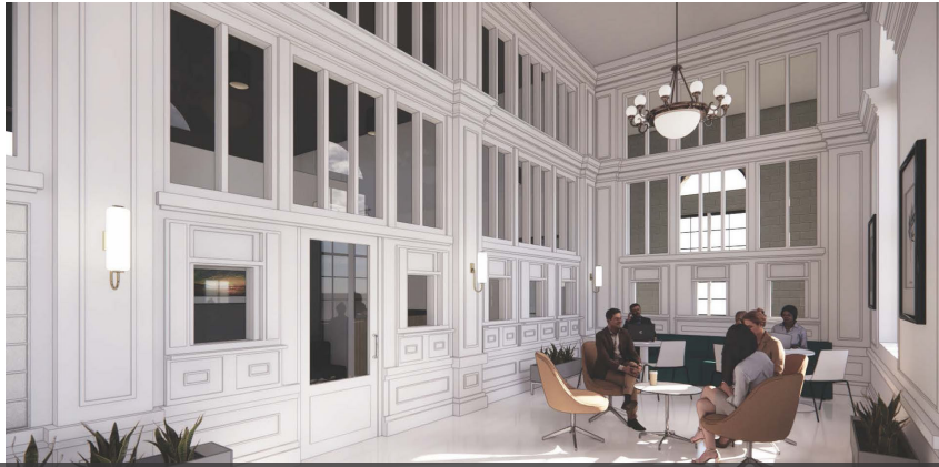
OFFICE ENTRY LOBBY FROM MAIN STREET

THE POST 401 N. Main Street Anderson, SC 29621