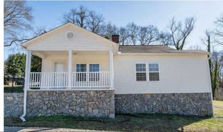
3997 Country Club Rd.