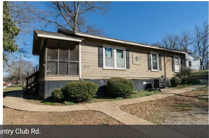
4095 Country Club Rd.