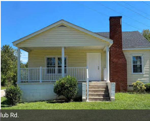
3995 Country Club Rd.