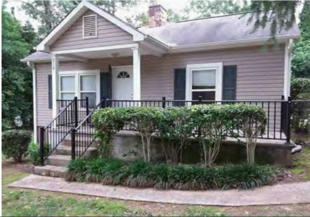
210 Hilton St.