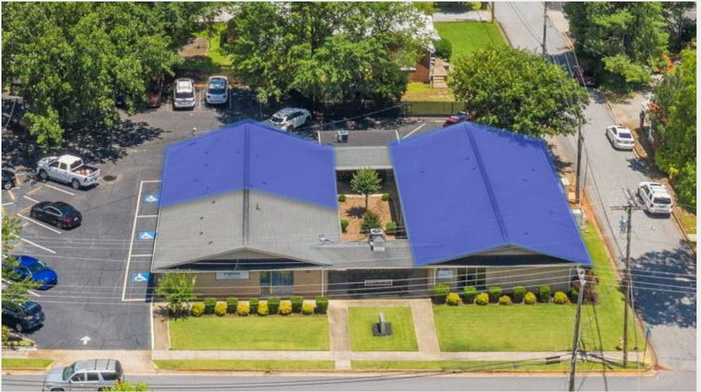
SHADED AREAS COMING AVAILABLE FOR OWNER-OCCUPANT