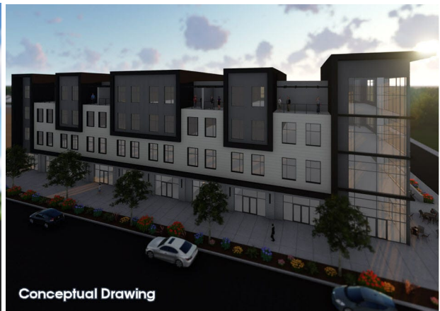
Conceptual Drawings Courtesy of Equip Studio, Inc. | www.equipstudio.com

All information contained herein has been obtained from sources deemed reliable, but we cannot guarantee it. It is also subject to change without notice.