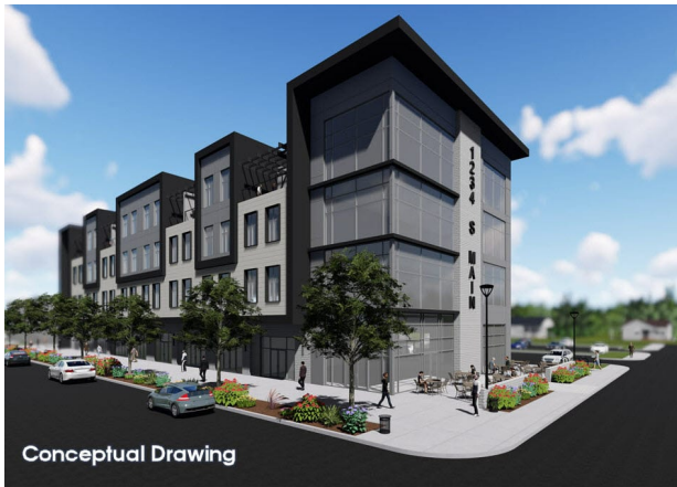
Conceptual Drawings Courtesy of Equip Studio, Inc. | www.equipstudio.com