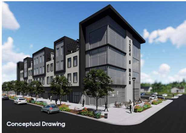
Conceptual Drawings Courtesy of Equip Studio, Inc. | www.equipstudio.com