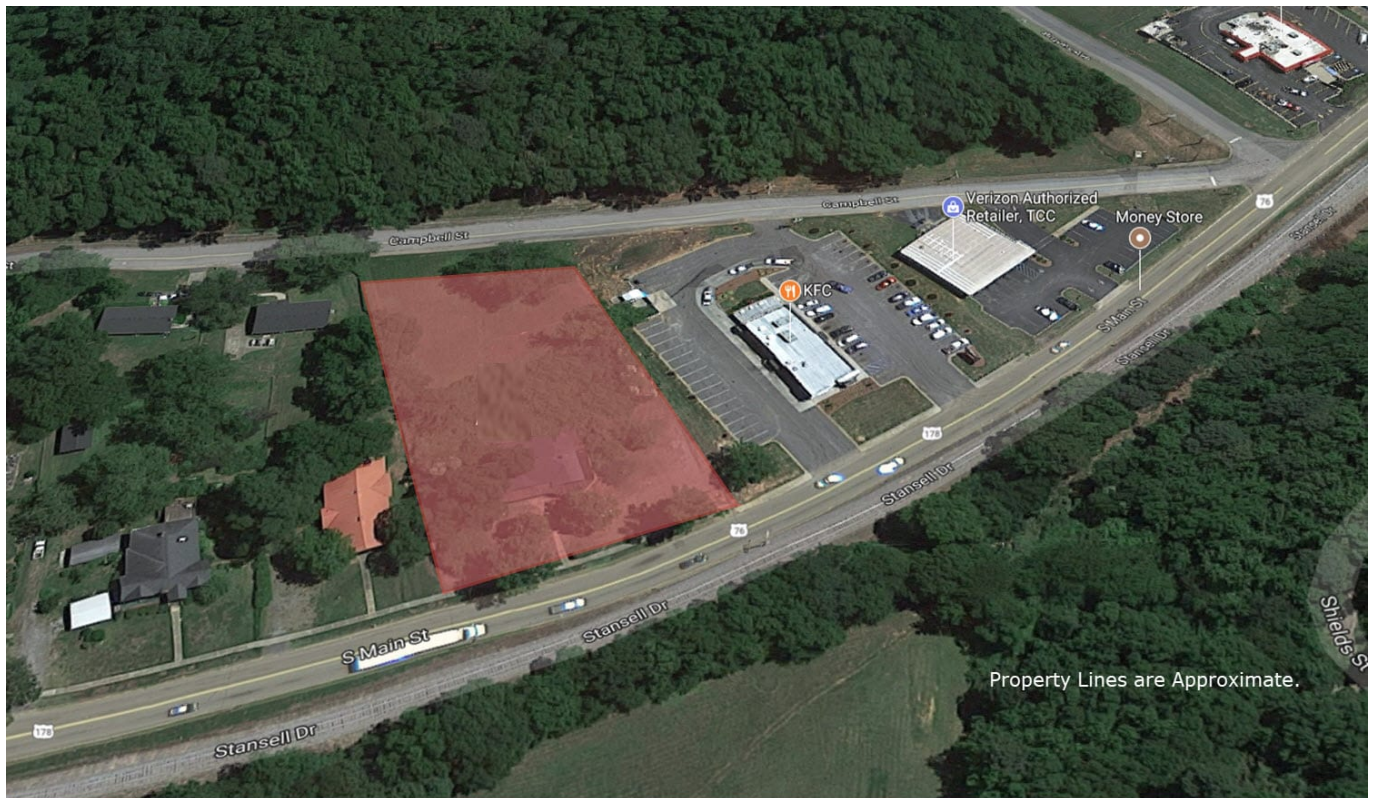
Located within Corridor of Newer Retail