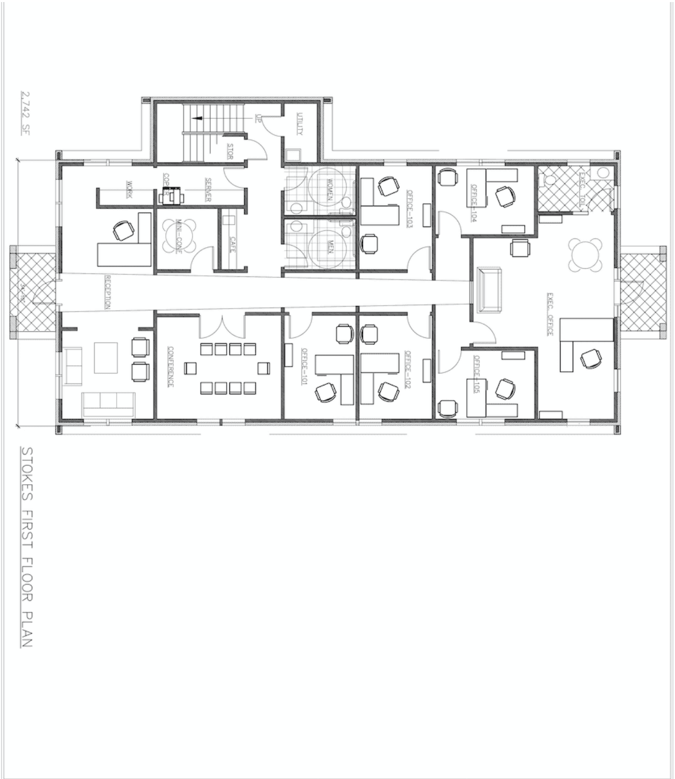
STOKES FIRST FLOOR PLAN

THIS DRAWING IS AN INSTRUMENT OF CONDITIONAL SERVICES. THE ARCHITECT SHALL NOT BE RESPONSIBLE FOR ACTUAL CONDITIONS, CONSTRUCTION AND/OR USE THEREOF. THIS DRAWING IS TO CONVEY DESIGN INTENTIONS AND/OR CODE COMPLIANCE ONLY. USE OF THIS DRAWING IMPLIES AGREEMENT WITH THESE CONDITIONS.