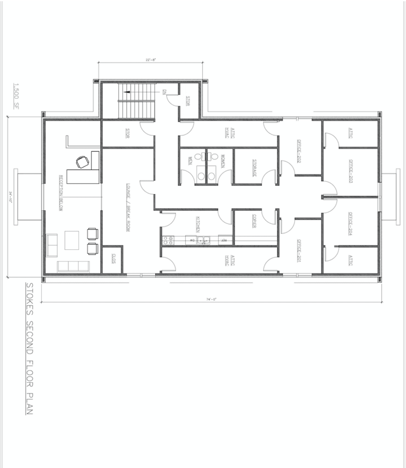
STOKES SECOND FLOOR PLAN

THIS DRAWING IS AN INSTRUMENT OF CONDITIONAL SERVICES; THE ARCHITECT SHALL NOT BE RESPONSIBLE FOR ACTUAL CONDITIONS, CONSTRUCTION AND/OR USE THEREOF. THIS DRAWING IS TO CONVEY DESIGN INTENTIONS AND/OR CODE COMPLIANCE ONLY. USE OF THIS DRAWING IMPLIES AGREEMENT WITH THESE CONDITIONS.