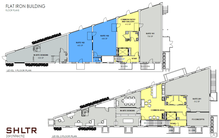
FLAT IRON BUILDING FLOOR PLANS